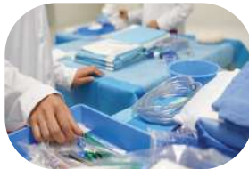
Custom Pack Production